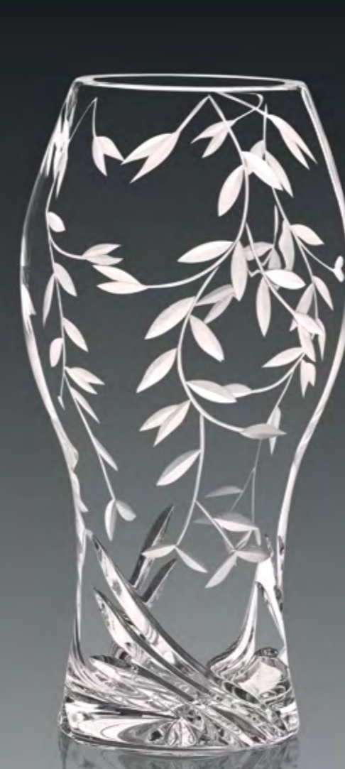
Essence Vase - S 150 mm