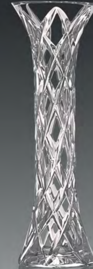
XVase - R 175 mm