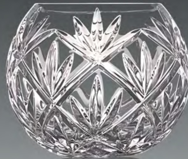
VA 534 - R 105 mm