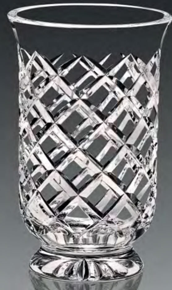
Tall Hurricane - S 150 mm