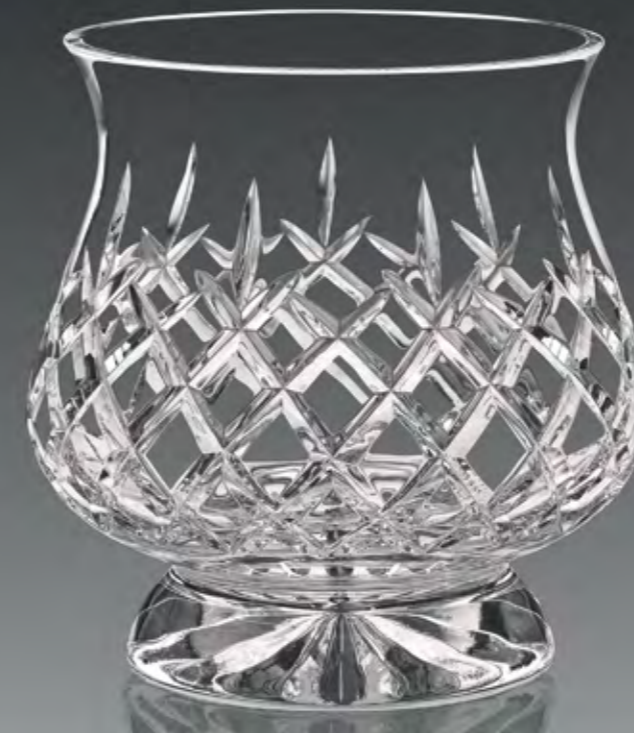
Short Hurricane - S 140 mm