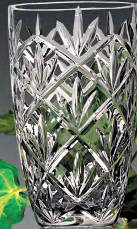
VA 531 - M 190 mm