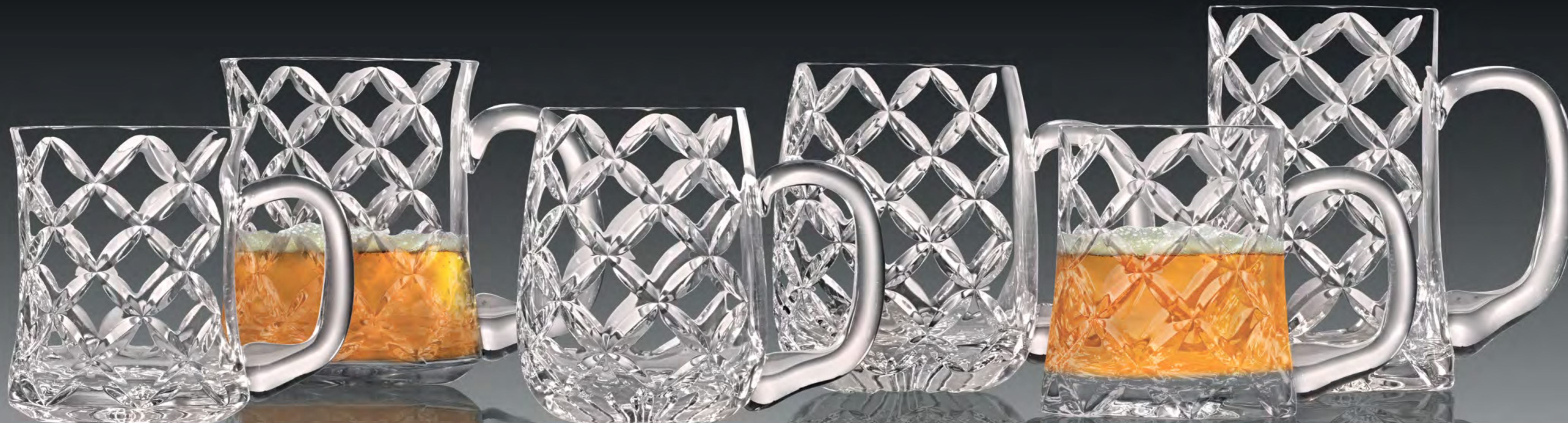
BM 602 - S 12 Oz