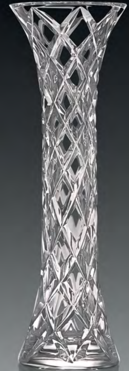
XVase - L 250 mm