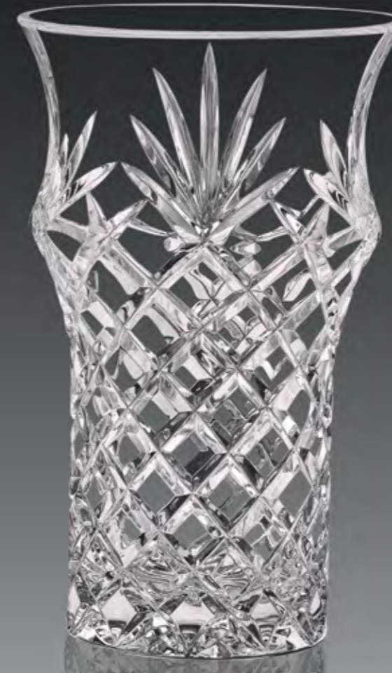
Fountain Vase - S 150 mm