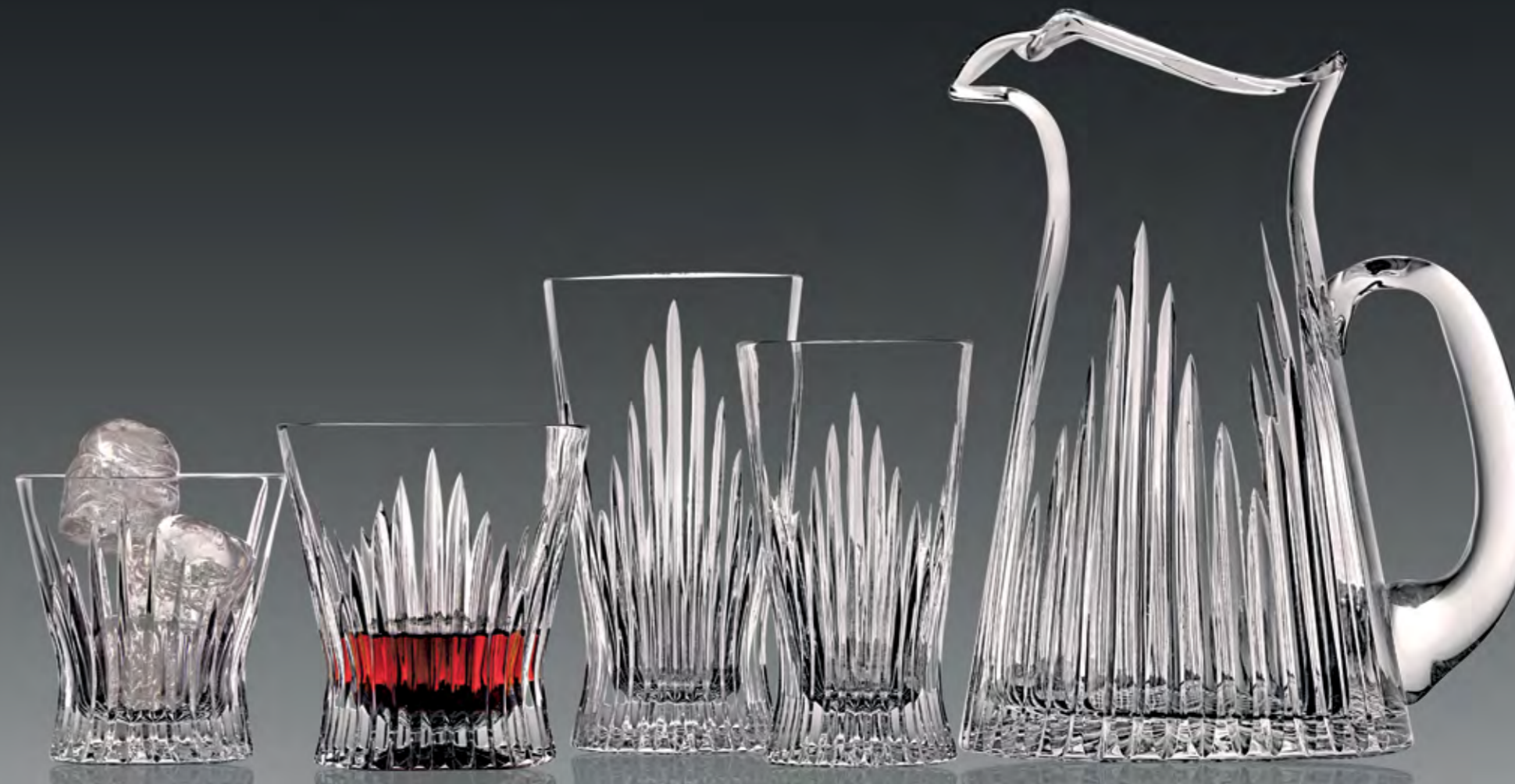
SOF 10 Oz