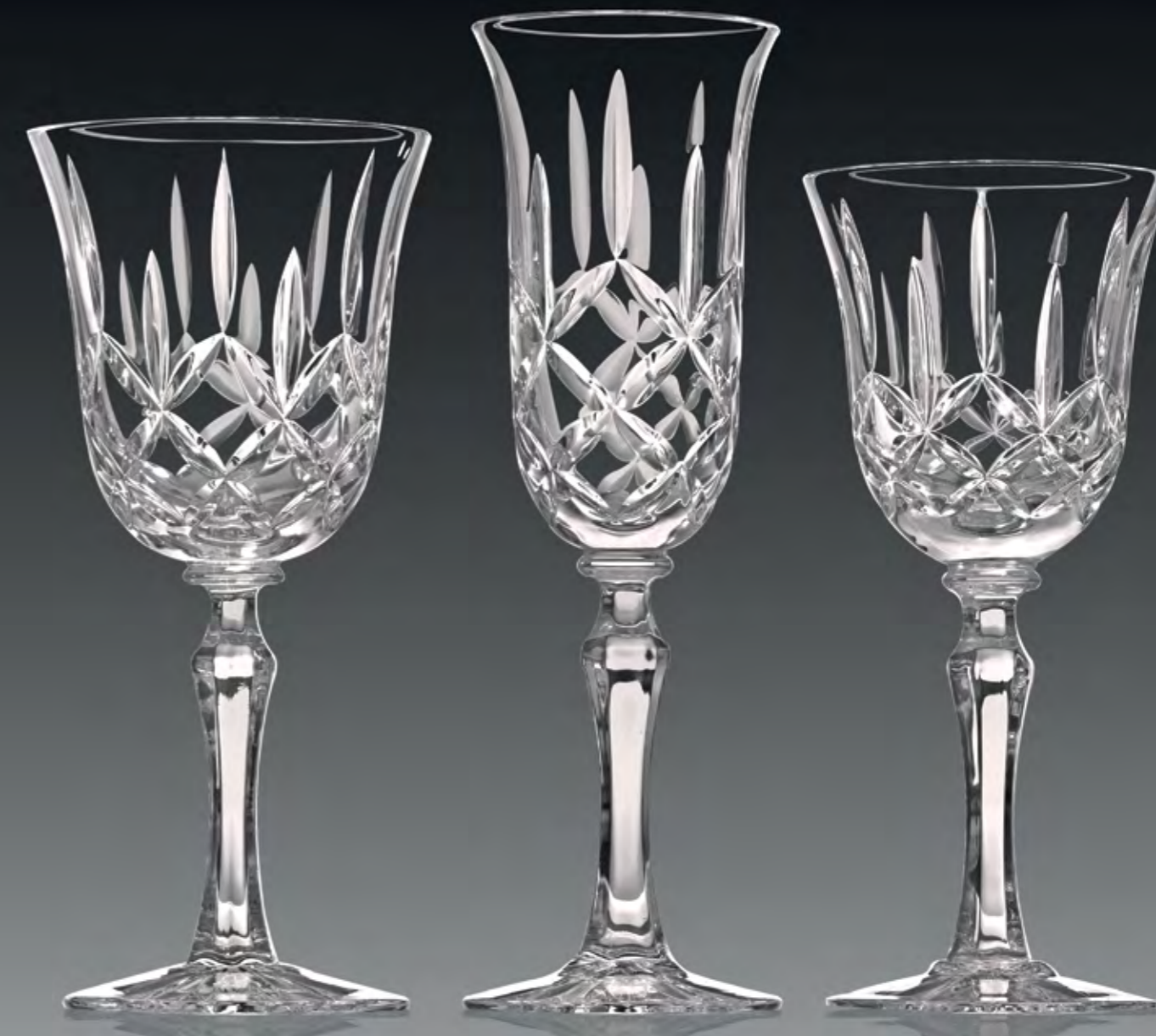
Goblet 7 Oz 180 mm