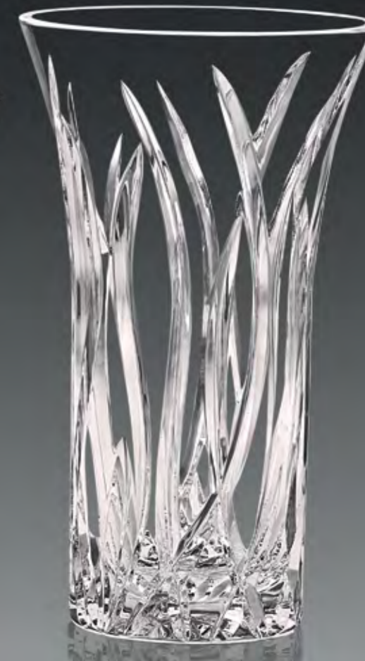
Flair Vase - M 200 mm (Cut - Grasse)