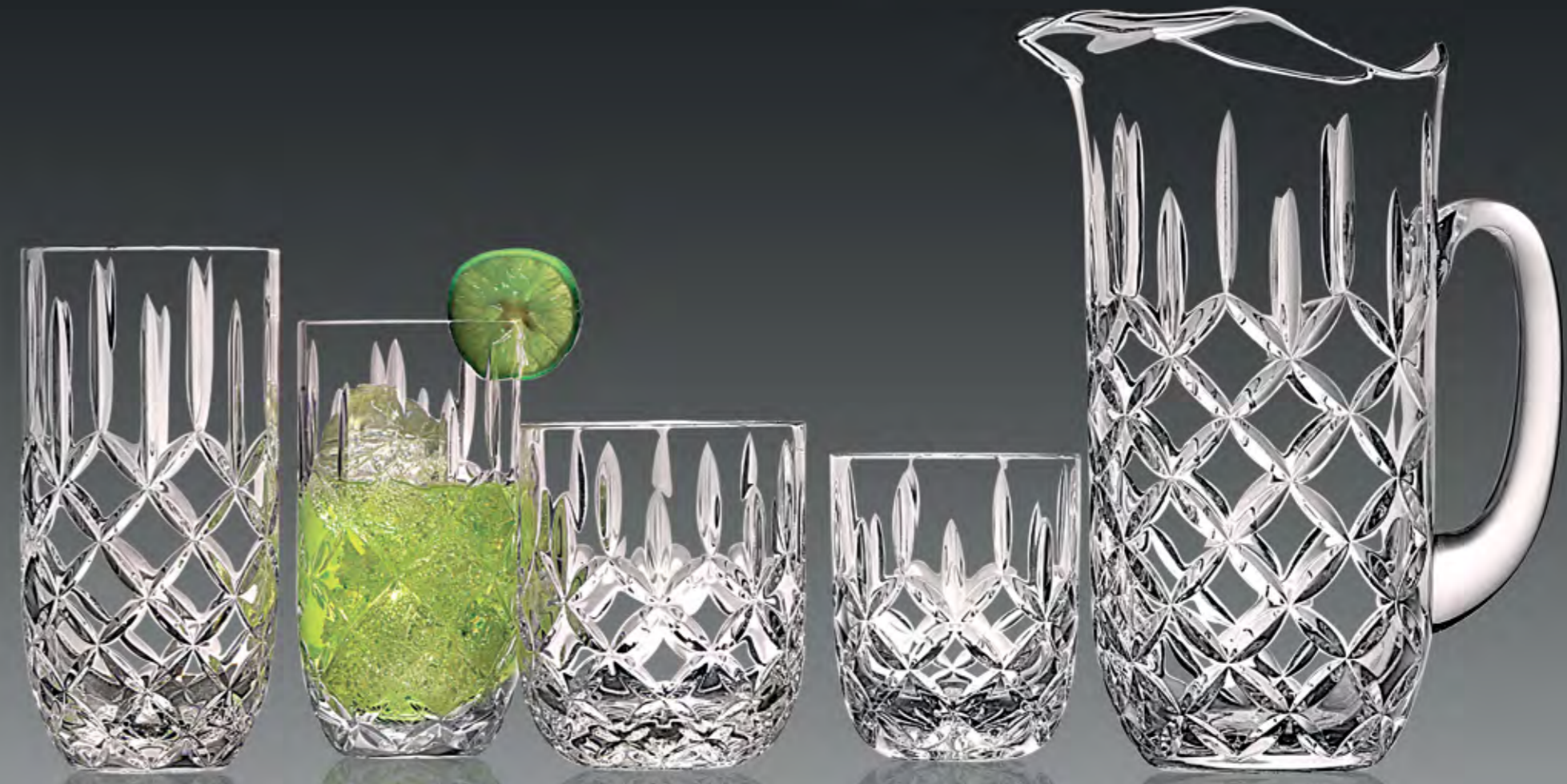
Hiball - L 14 Oz