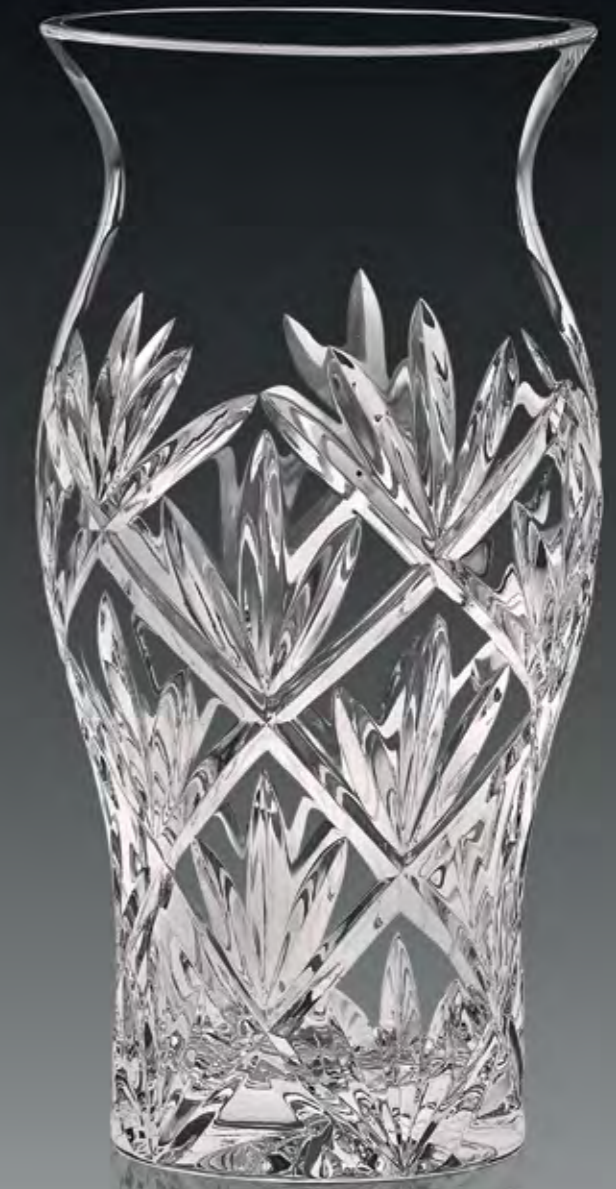
Curva Vase - L 250 mm