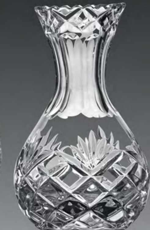
VA 505 110 mm