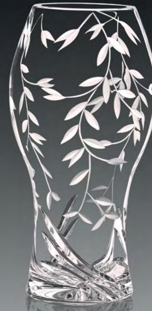
Essence Vase - M 200 mm