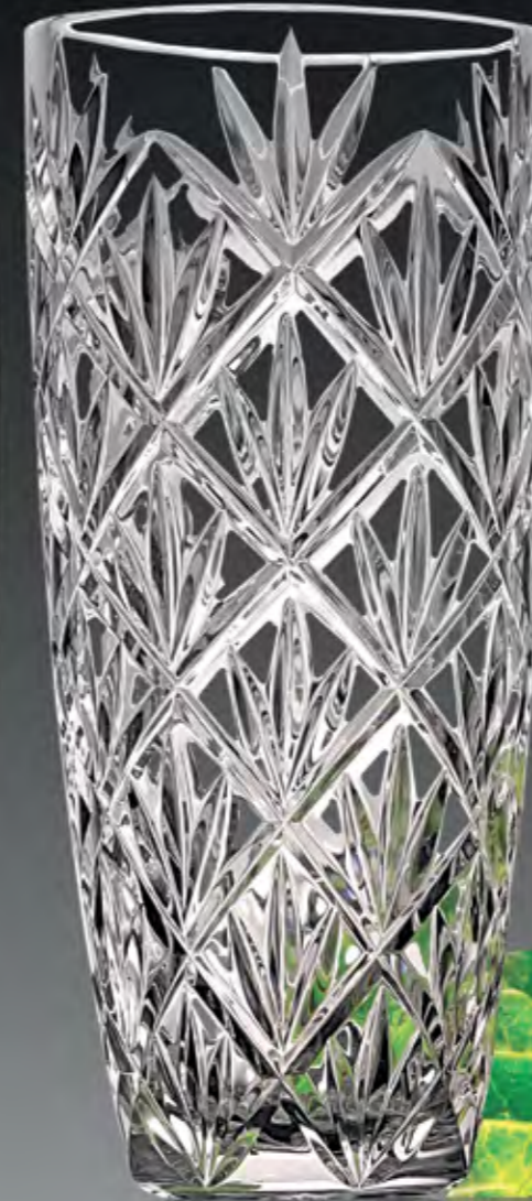
VA 532 270 mm