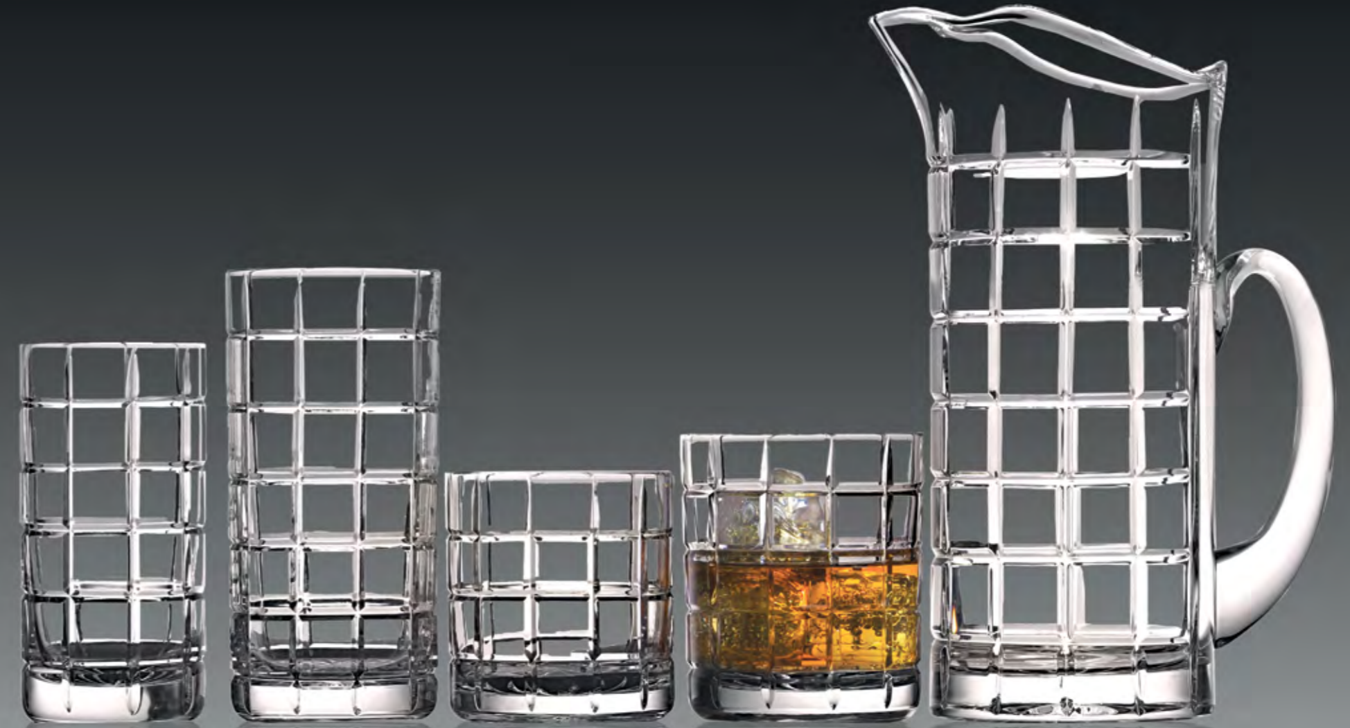
Hiball - S 10 Oz