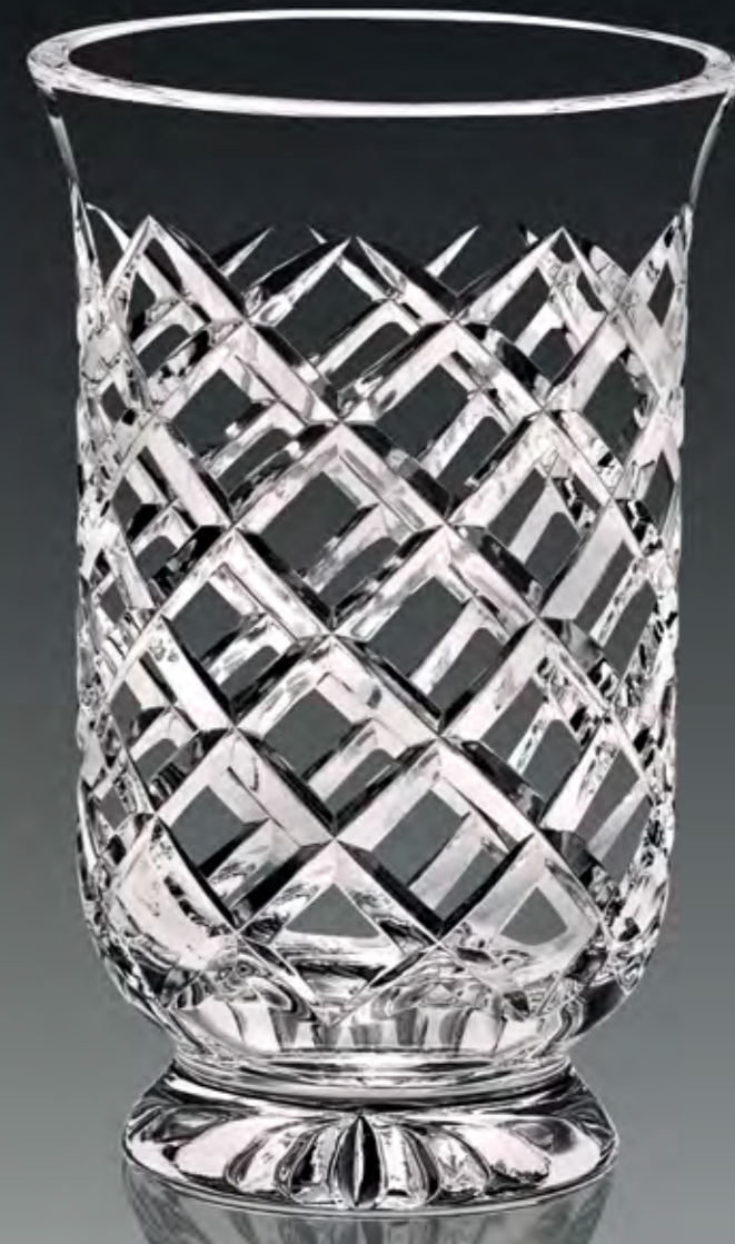
Tall Hurricane - L 250 mm