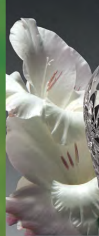
VA 507 120 mm