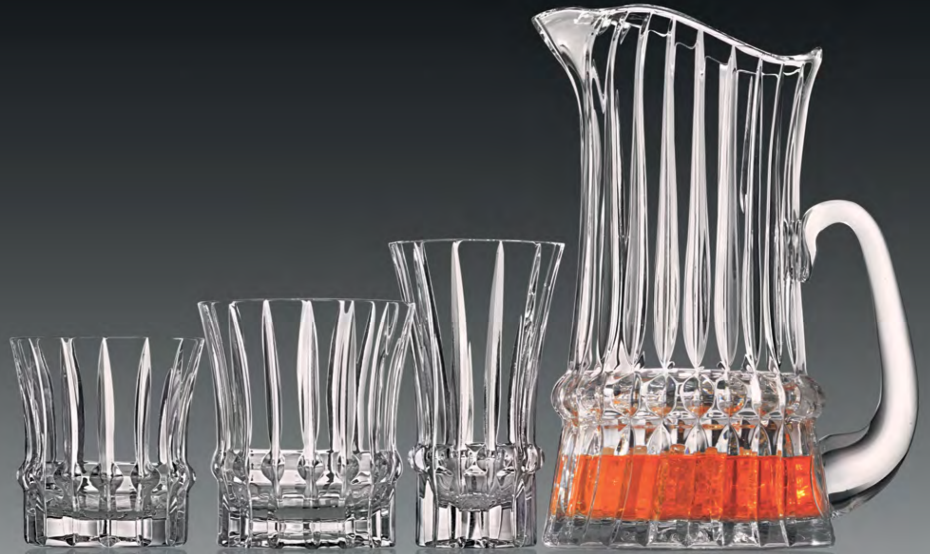
SOF 10 Oz