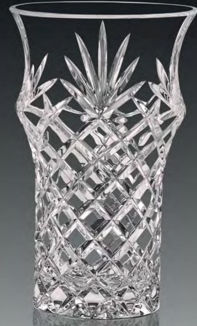
Fountain Vase - M 200 mm