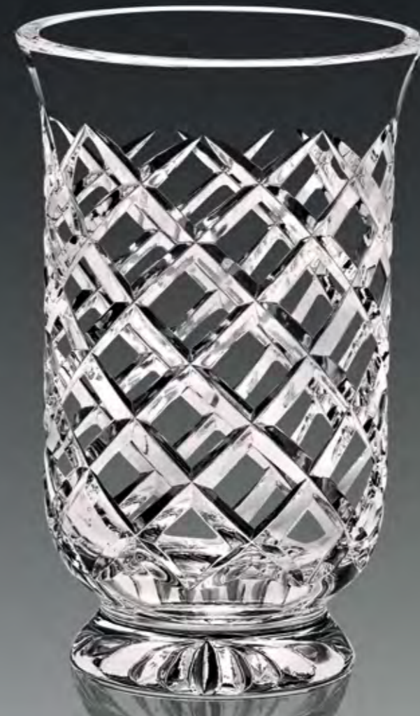
Tall Hurricane - M 200 mm