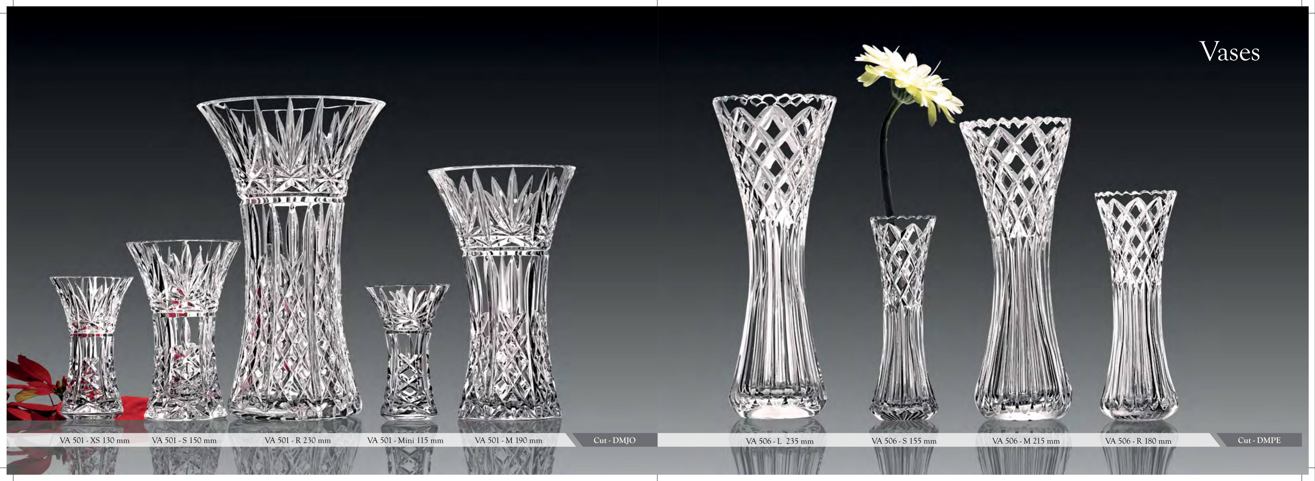
VA 501 - XS 130 mm