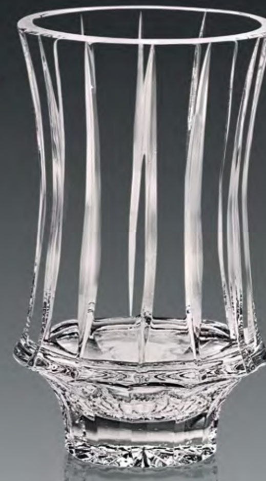
Valerie Vase - M 200 mm (Cut - Peerage)