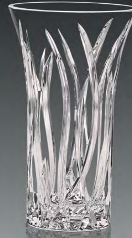
Flair Vase - S 150 mm