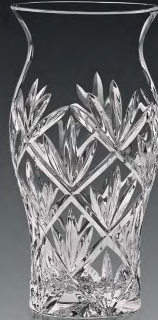
Curva Vase - M 200 mm