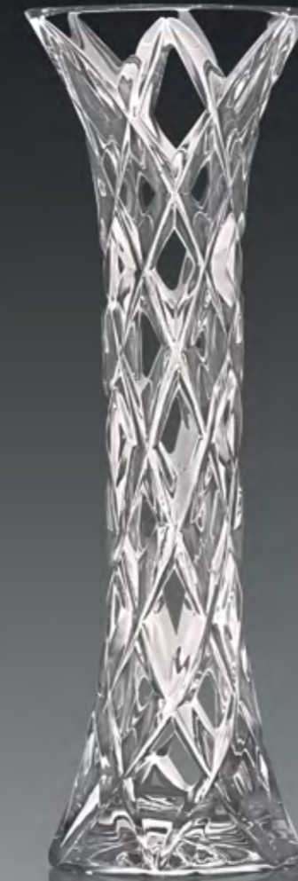
XVase - M 200 mm