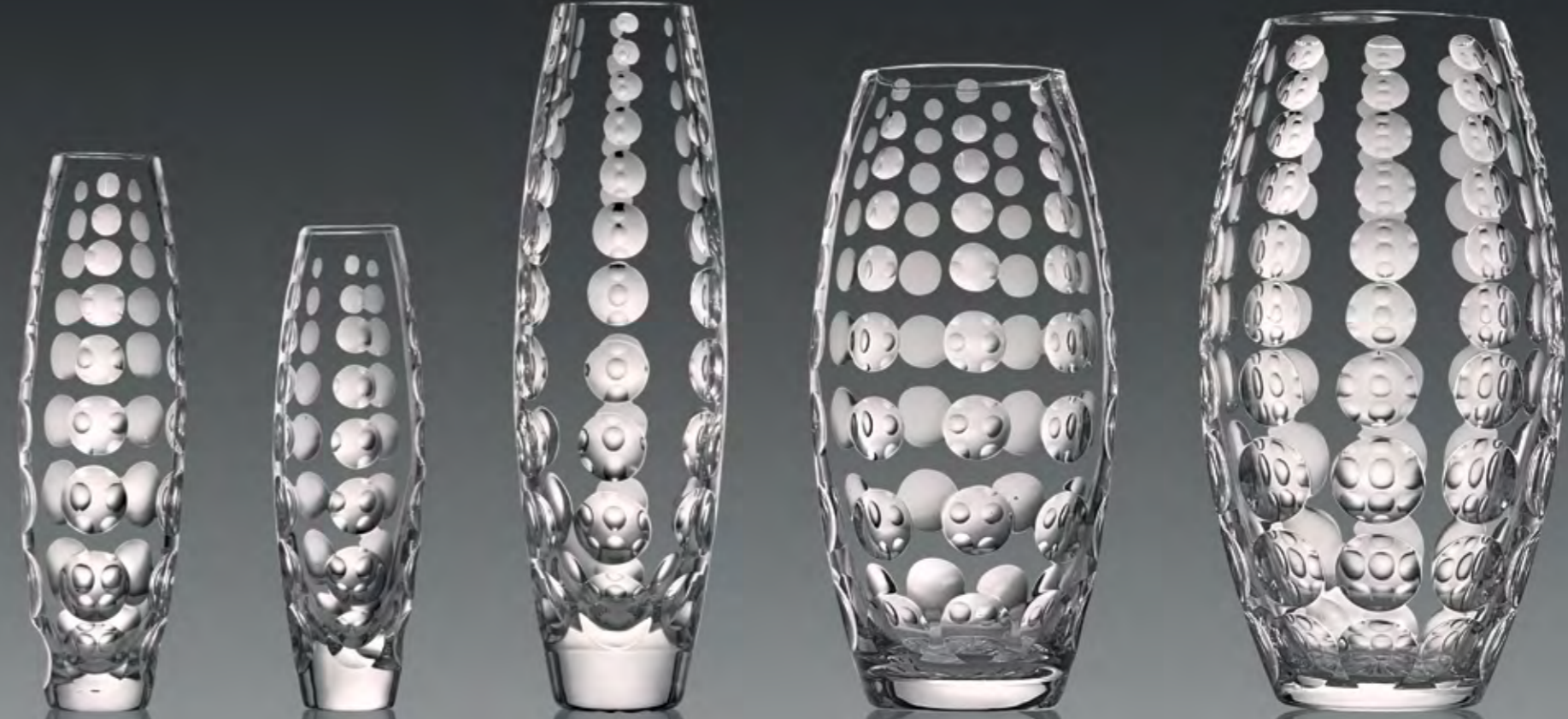
Barrel Vase - M 200 mm