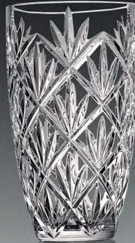
VA 531 - R 230 mm