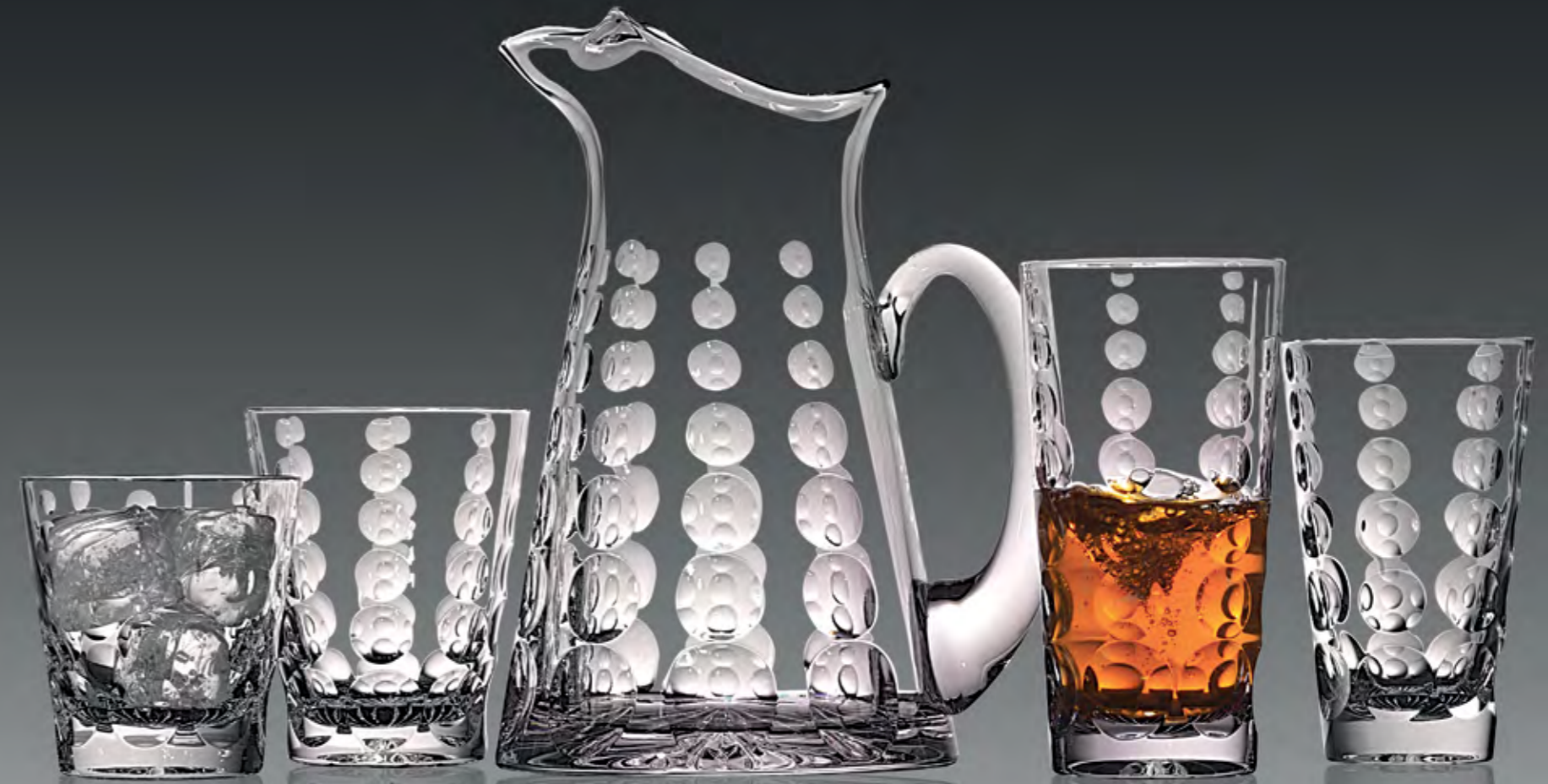
SOF 10 Oz