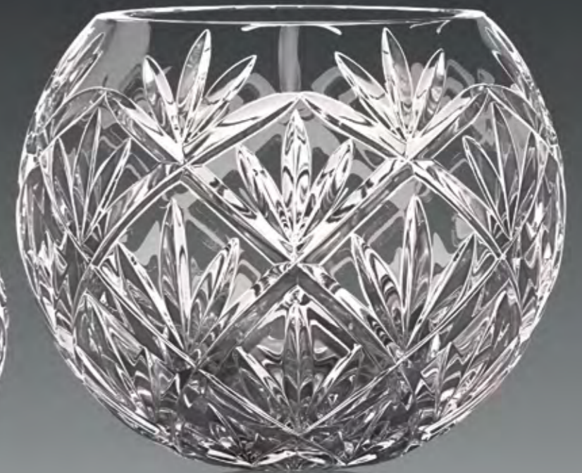
VA 534 - L 125 mm