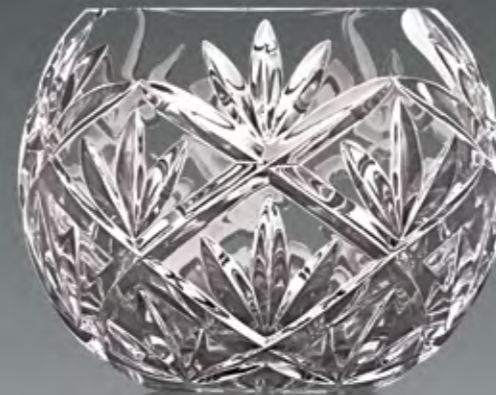
VA 534 - S 75 mm